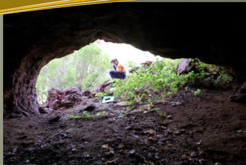
Rock shelter in the Western Pilbara region.